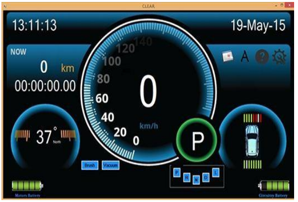
Figure 2. Graphical User Interface (GUI) for 'CLEAR'.

The main purpose of the GUI is to give all controls in the hand of user, so that he can use this product according to his needs. The software used for the programming of GUI of this device is Visual Studio 2012. As discussed, the robot can be used in manual mode as well as autonomous mode. Selection of the mode can also be done from this GUI. Visual Studio receives the data from COM port and displays it on the GUI after decoding. However, the communication via Bluetooth is 2-way i.e. it sends some data as a delivery report. The terms, indicators and labels used in GUI for power controlling and management are employed under sections: 4.3-4.6 of IEEEStd. 1621. A photograph of GUI for smart floor cleaning robot (CLEAR) is shown in Figure 2.