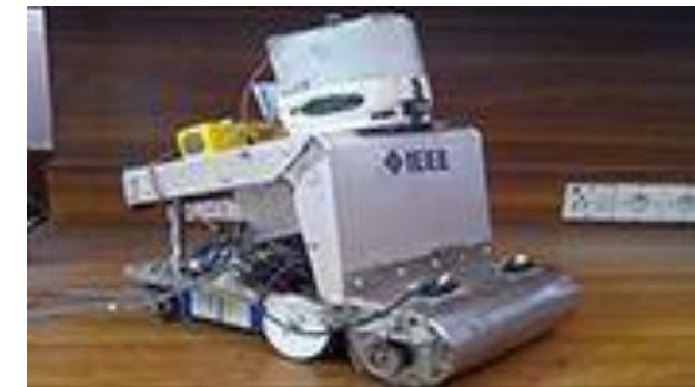
Figure 1.Mechanical Design of CLEAR.

Mechanical body consists of four parts i.e., chassis, brushing mechanism, vacuum cleaning and dirt disposal mechanism. Combination all these four parts makes a complete prototype for testing, as shown in Figure 1. Before fabrication, complete CAD Model was designed using a commercially available software.